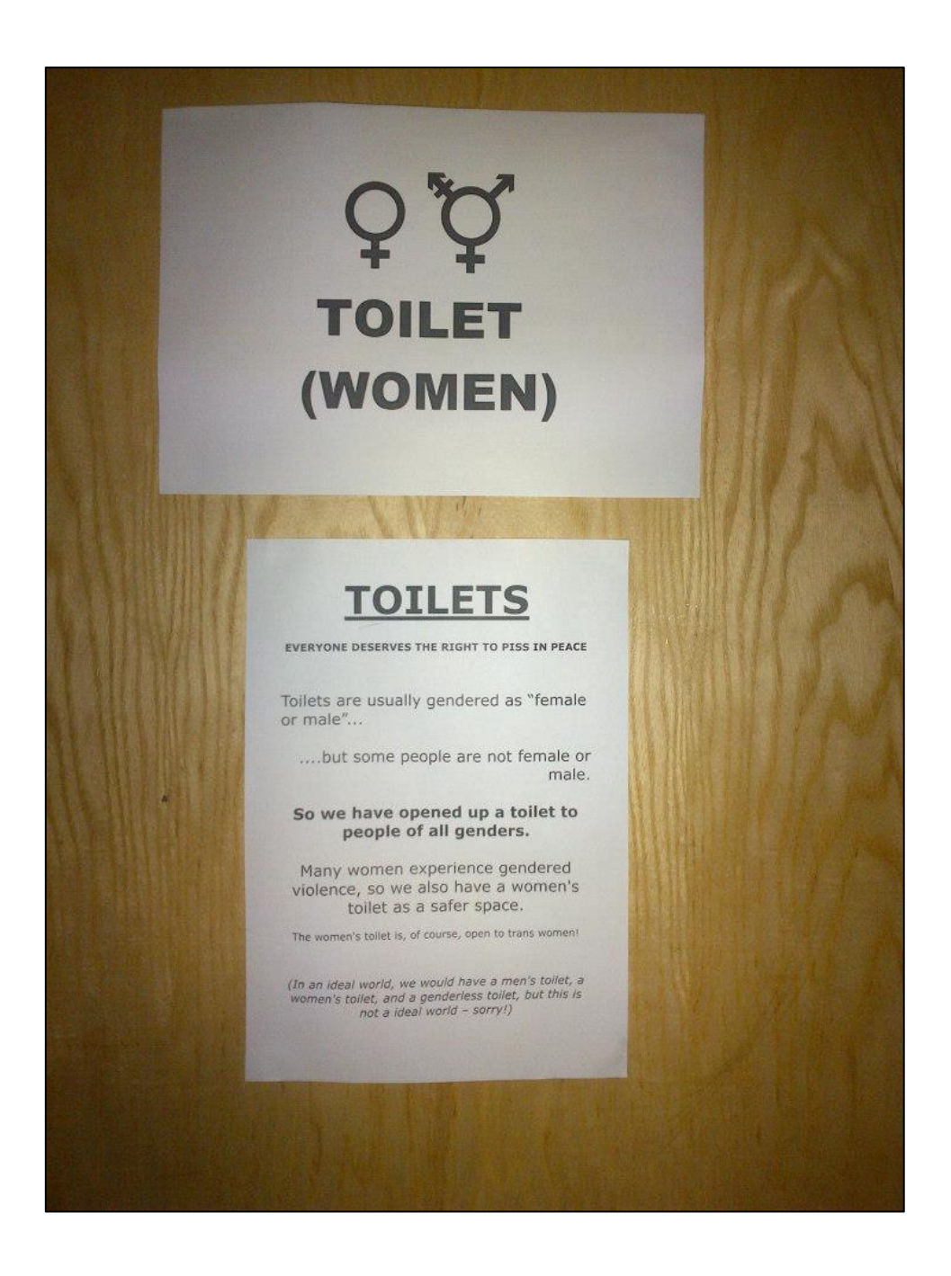
Figure 3: Toilet door sign at Revolt

seen to be of benefit to the wider world, not just to trans audiences; and in turn, it was beneficial for trans people to engage with wider communities and socio-political issues. For this reason, it made sense to organise the Trans Tent under the wider umbrella of LGBT Pride: 'trans' alone was not the overarching theme of the event. Instead, the Trans Tent was just one part of a large celebration of diversity, inclusivity and openness within a community-oriented, 'family-friendly' setting. Similarly, gigs such as the GYGL fundraiser, Queer We Go, Revolt and Cutlery Drawer gigs